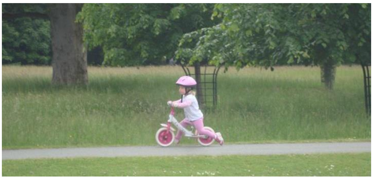
Image 1: All ages and abilities should be able to cycle safely in company, and the 8-80 age cohort should be able to cycle safely independently

It is good to see that the bye-law public consultation was included on the Council's website, a variety of media and on <a href="https://www.speedlimits.ie">www.speedlimits.ie</a>